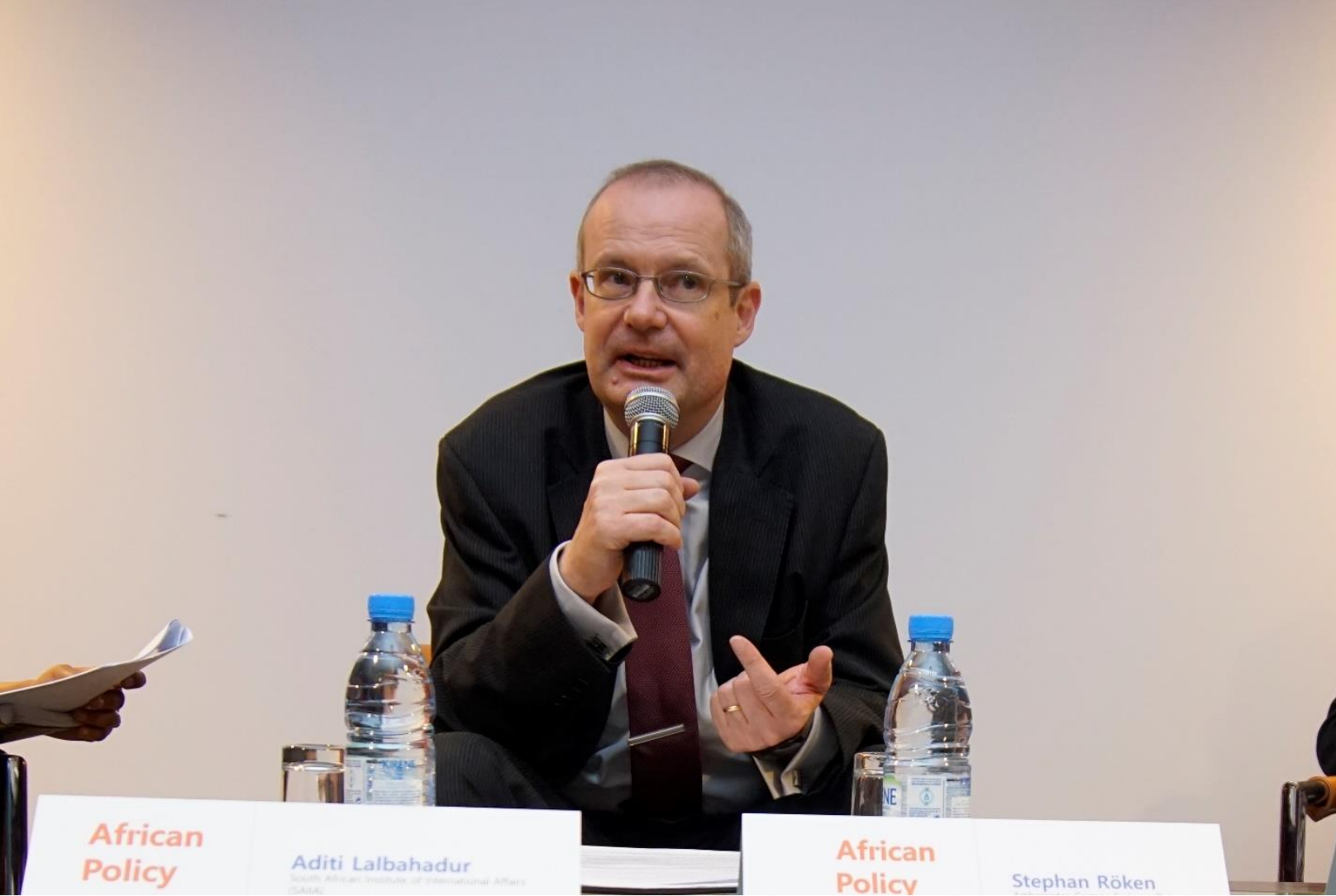
Stephan Röken , Ambassador, German Embassy Dakar

Countries in Europe have no common ground when it comes to migration, and it has been indicated that there is no such thing as the European perspective on migration. Several experts believe that Europe is not dealing with international issues but with internal issues which are not limited to Brexit and the unsolved euro crisis- the case for nationalism. However, individual European countries take different stances in their view on migration and of the Global Compact on Migration. For example, two notable countries, Germany and Austria, have conflicting resolutions about signing the pact.