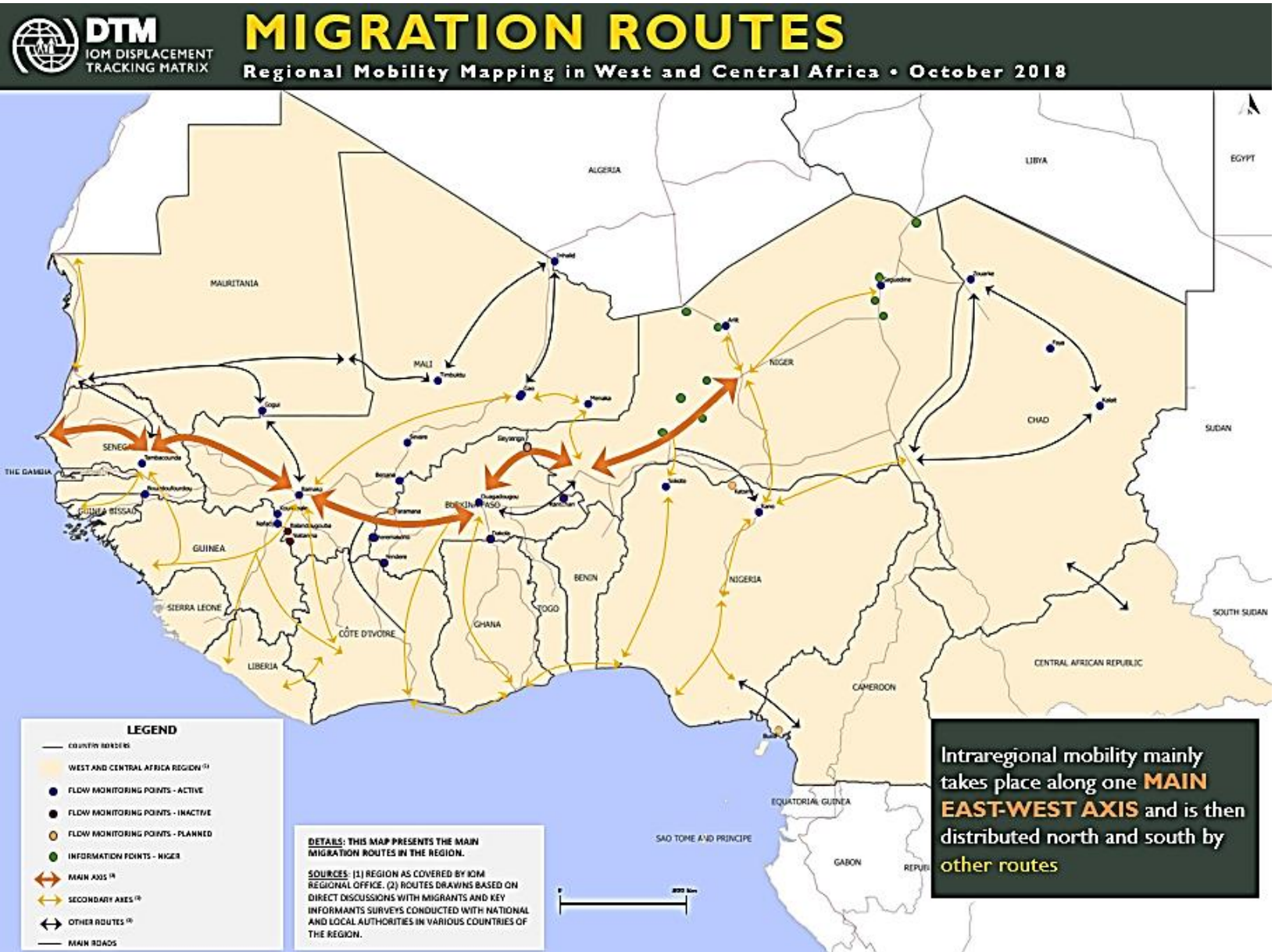
Source: IOM Displacement Tracking Matrix, 2018

Participants identified major destination areas of migration flows from various countries in Africa. An estimated 90 to 95 percent of migration flows in west and central Africa are internal to the region. The largest registered migrant populations in the region are currently living in Côte d'Ivoire and Nigeria (UNDESA). Most are migrants originating from neighboring countries. Participants noted that mobility is largely driven by employment opportunities to labour intensive areas that may change according to the season (wet/dry).