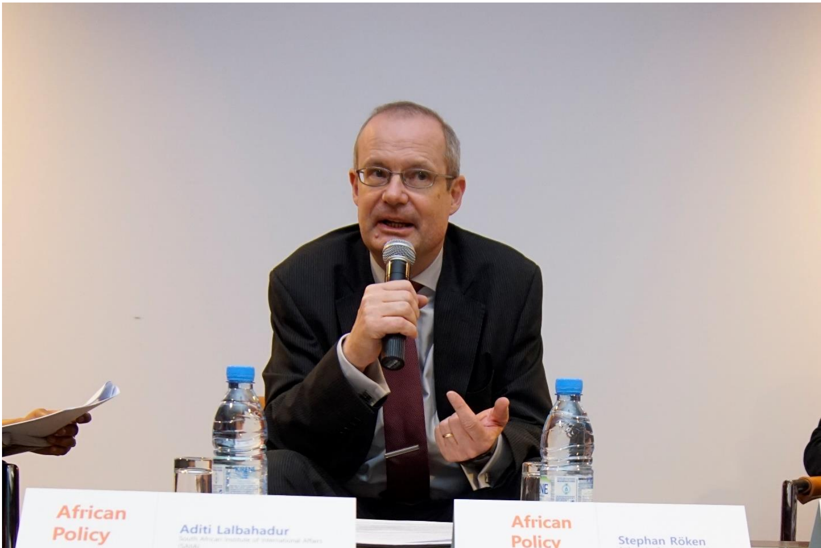
Stephan Röken , Ambassador, German Embassy Dakar

Countries in Europe have no common ground when it comes to migration, and it has been indicated that there is no such thing as the European perspective on migration. Several experts believe that Europe is not dealing with international issues but with internal issues which are not limited to Brexit and the unsolved euro crisis- the case for nationalism. However, individual European countries take different stances in their view on migration and of the Global Compact on Migration. For example, two notable countries, Germany and Austria, have conflicting resolutions about signing the pact.